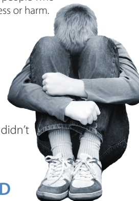
Zhang et al. (2016)

22% of students ages 12 to 18 years old reported being BULLIED AT SCHOOL