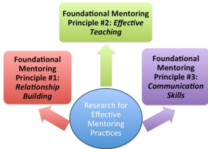
Framework for Teaching Mentoring Modules